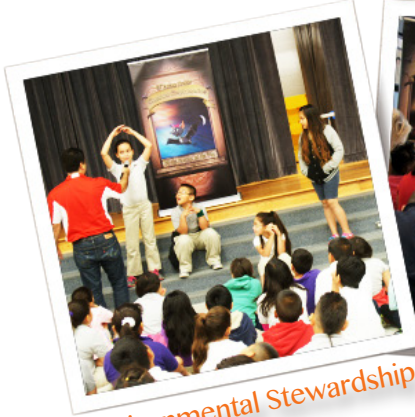
Environmental Stewardship Presentations