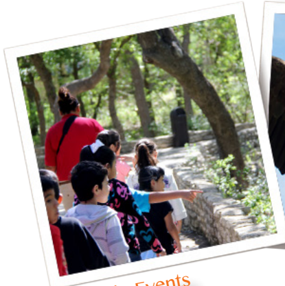
Field Trip Events