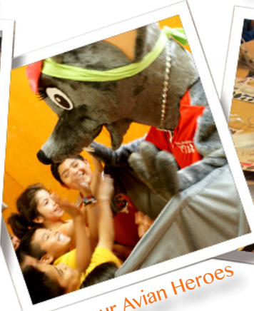
Meet your Avian Heroes