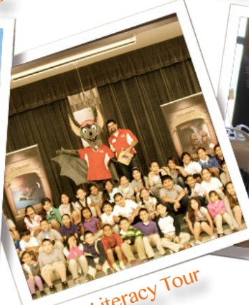
Austin ISD Literacy Tour